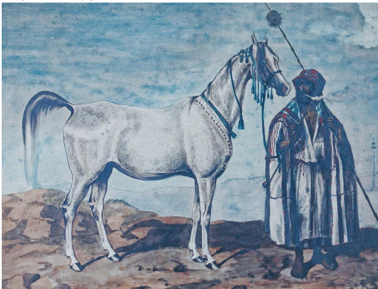
Mlecha, by Juliusz Kossak, 1845. Property of Janów Podlaski State Stud