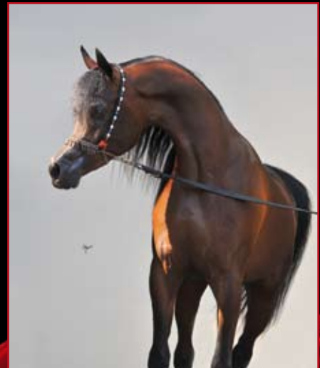
EMERALD J OWNED BY AL JALAWIYAH STUD / KSA