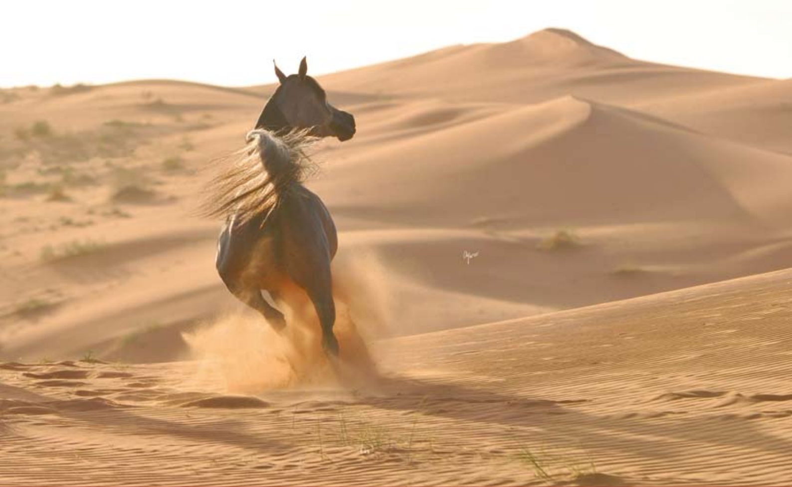
EVENING IN THE DESERT OF RIVADH