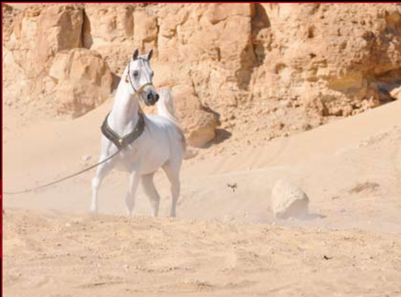
JAMAL ELKUWAIT - OWNED BY MAI STUD / KW