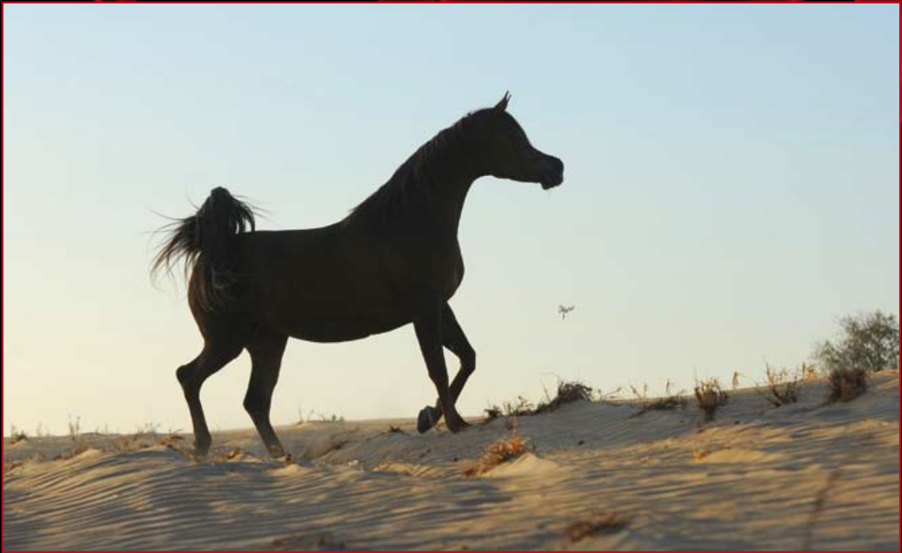
FRASERA MASHARA - OWNED BY DUBAI STUD / UAE