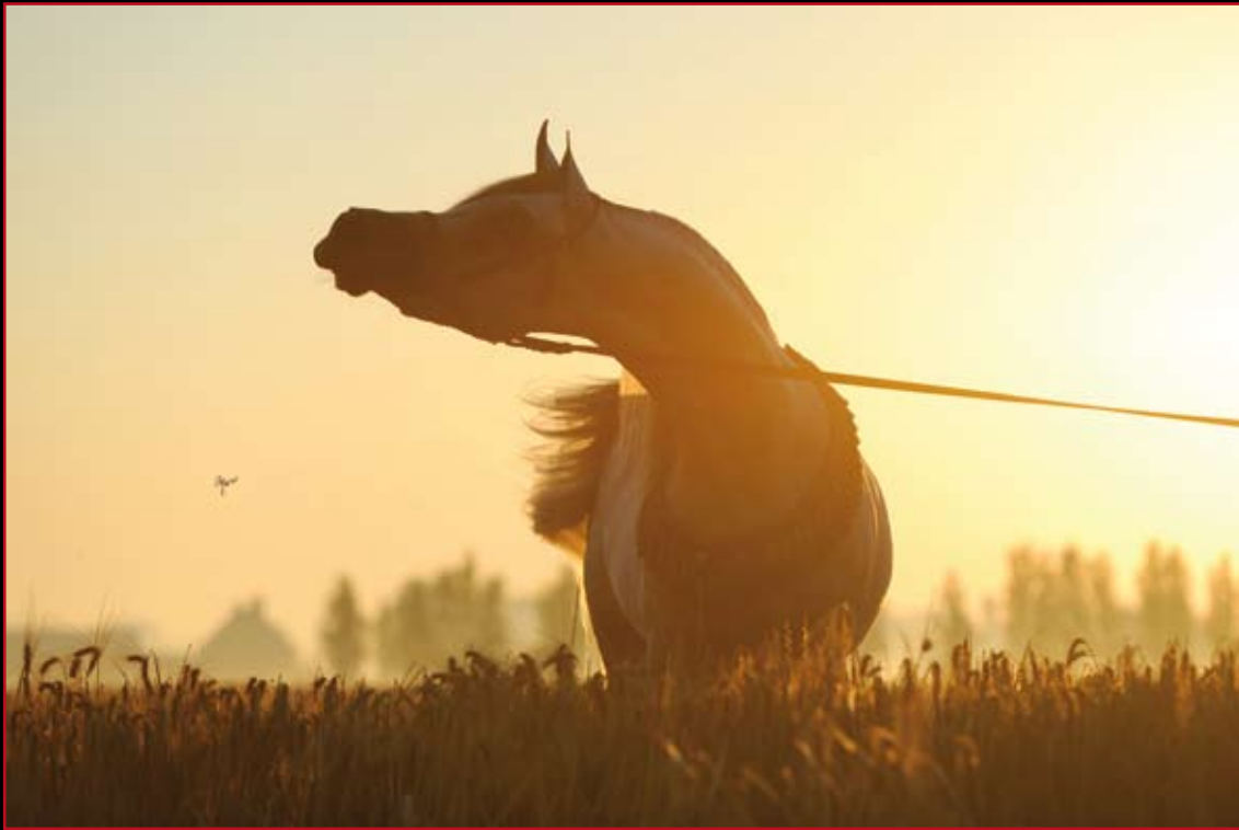
D'JUSTIN - OWNED BY ESM ARABIANS / BE