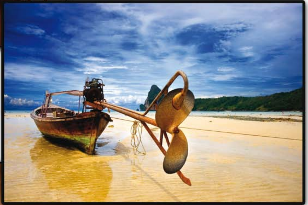
(ABOVE) KOH PI PI ISLAND, THAILAND