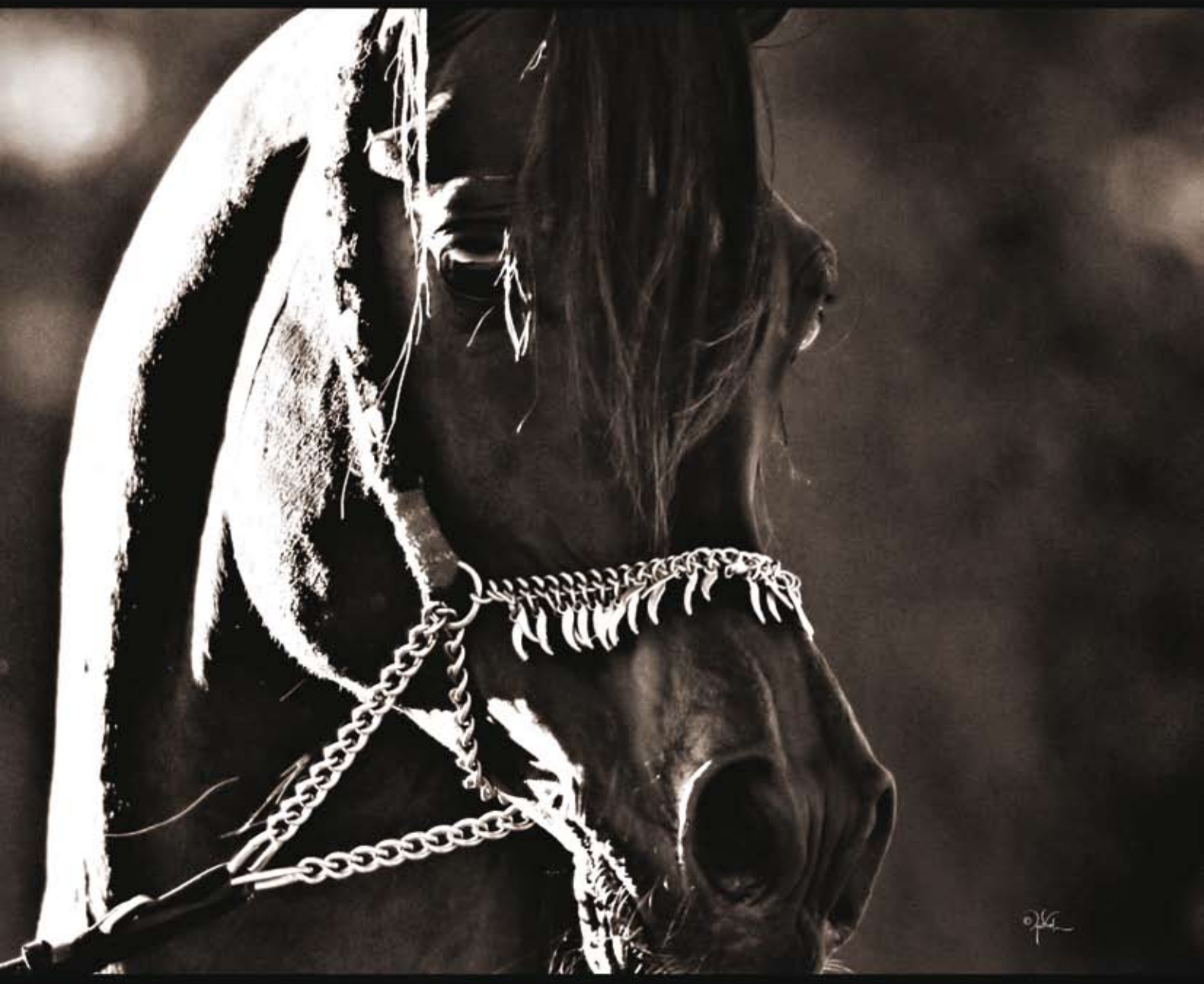
*GAZAL AL SHAQAB