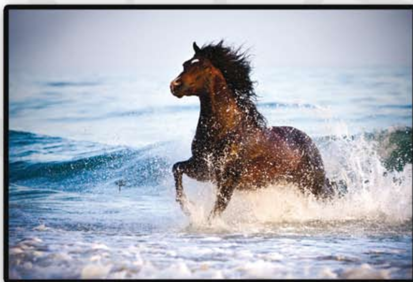
BAROQUE HORSES SHOT DURING THE SANTA YNEZ WORKSHOP HOSTED BY APRIL VISEL