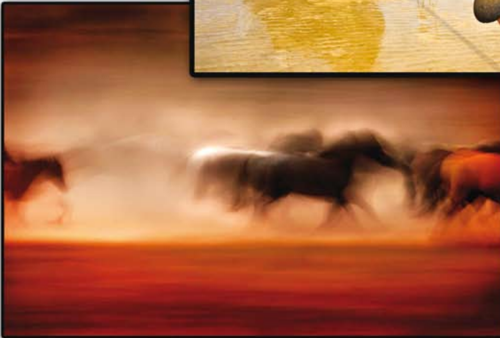
(BELOW) WILD MUSTANGS SANTA FE NEW MEXICO