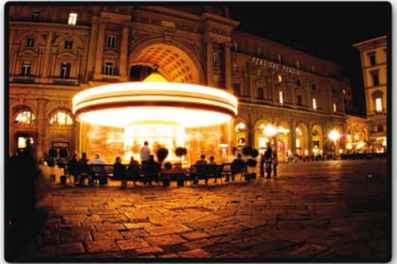
(ABOVE) PIAZZA DELLA REPUBBLICA, FLORENCE ITALY