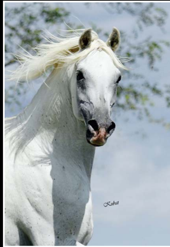
ICHAM, BRED & OWNED BY STUDERARABIANS, FRANCE