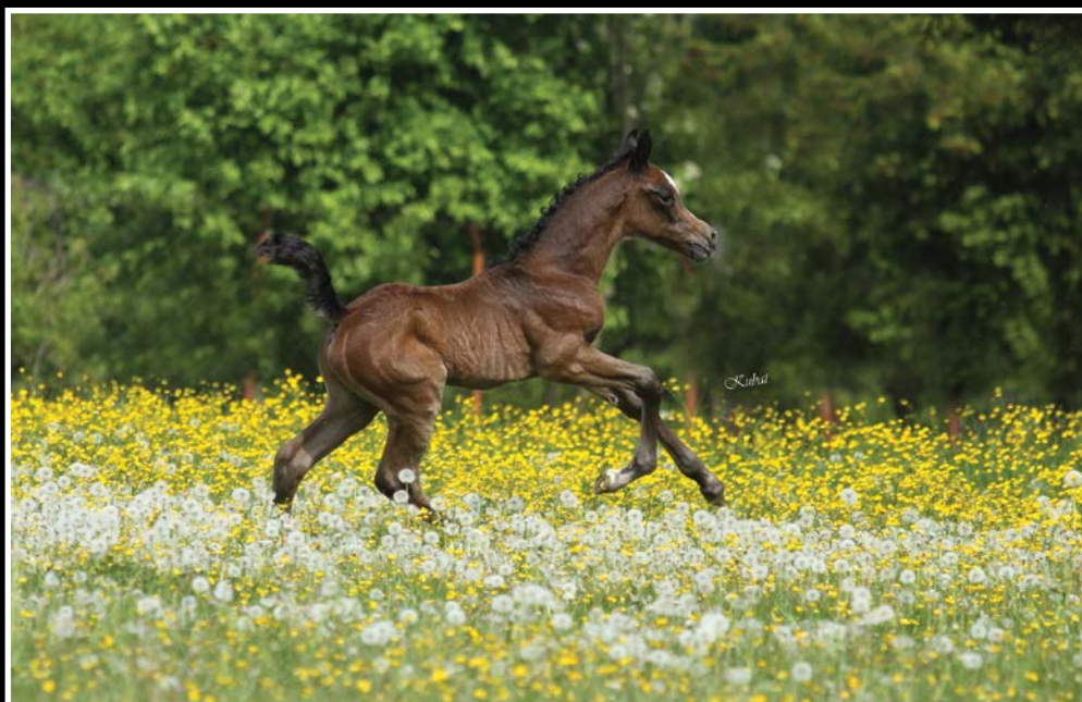
KP ANTAR IBN AL LAHAB, BRED & OWNED KAUBER PLATTE STUDD, GERMANY