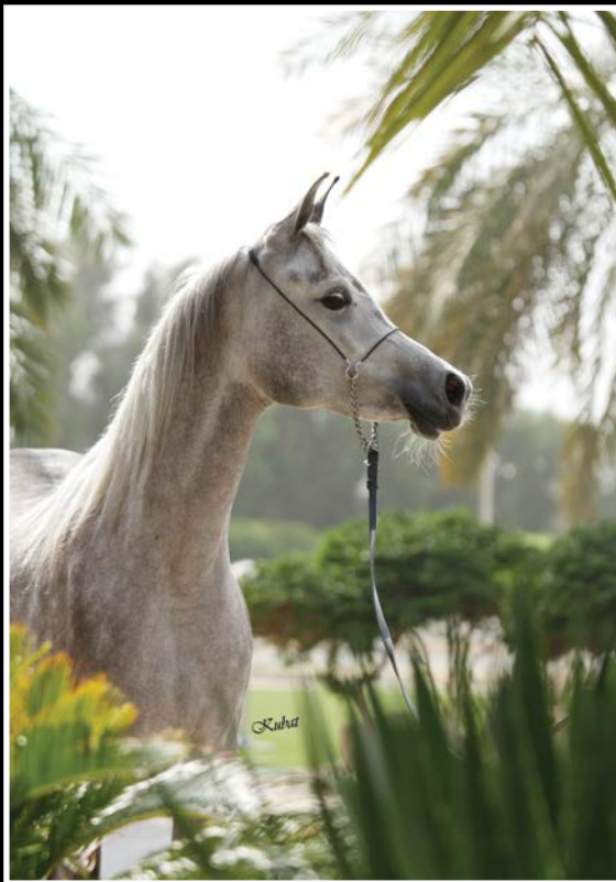
AJMAL SARA, BRED & OWNED BY AJMAL ARABIAN STUD, KUWAIT