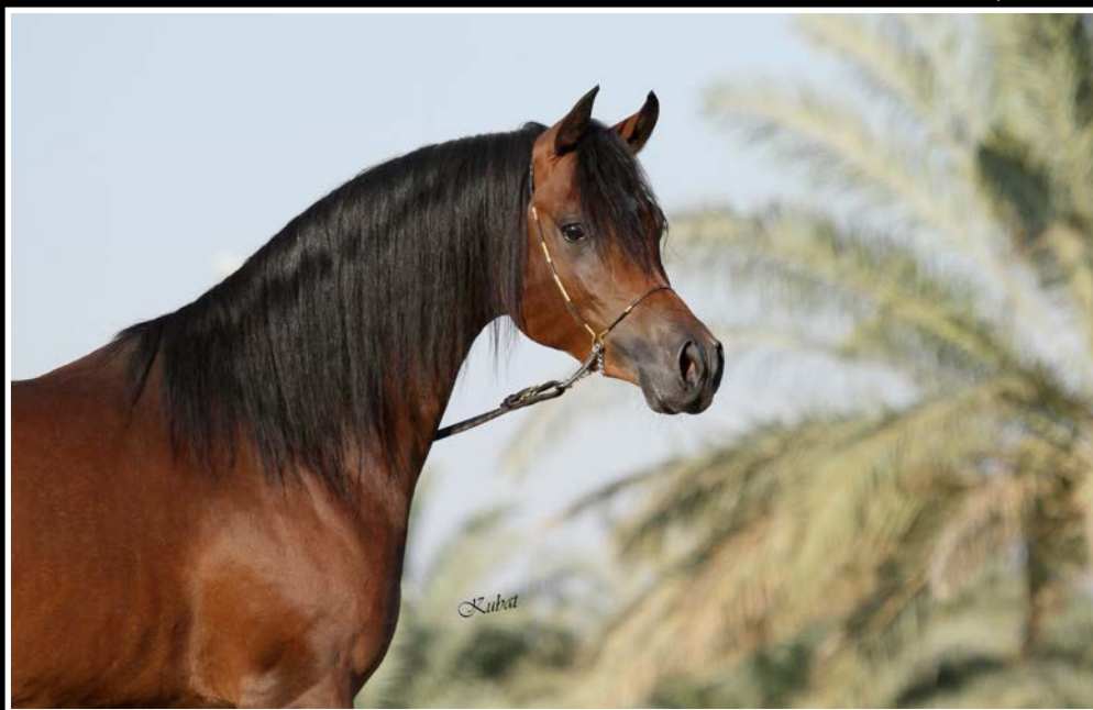
BAHHEI EZZAIN, BRED & OWNED BY EZZAIN ARABIANS, KUWAIT