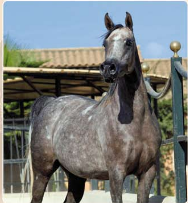
Homebred mare ZINGARA PSYCHE (Padrons Psyche x Zguba)