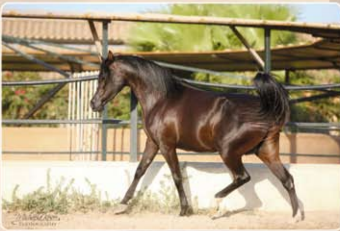
Homebred mare Lady Moura (Gladysz x Fotogramma)