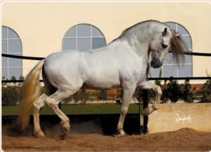
Andalusian Stallion UNGIDO IV