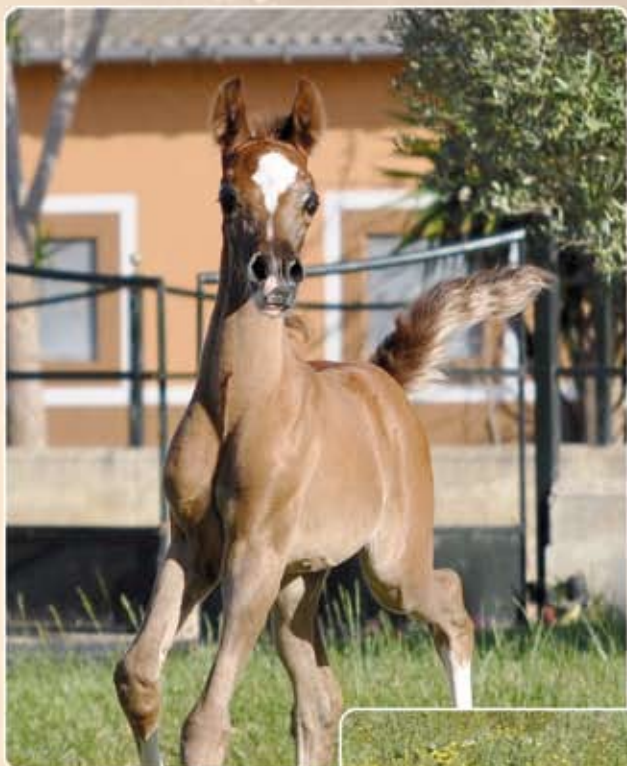
Homebred Colt 2012 BV ARGENTYN (Shangai EA x Alessia Psyche by Padrons Psyche)