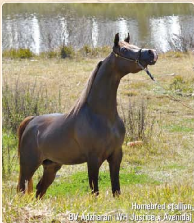
Homebred stallion BV Adzharan (WH Justice x Avenida)