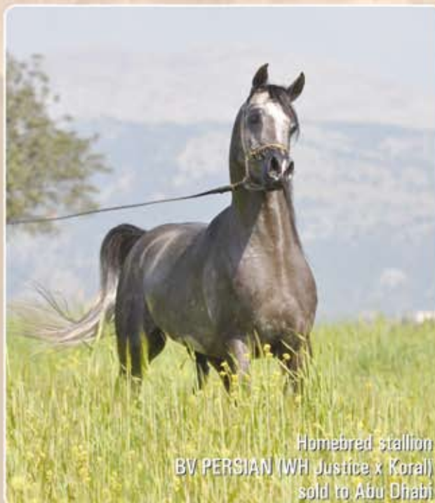
Homebred stallion BV PERSIAN (WH Justice x Korall) sold to Abu Dhabi

very impressive but easy to handle and calm down. They have a very sweet and compliant character, that makes them a very attractive horse for any kind of rider with any kind of level.