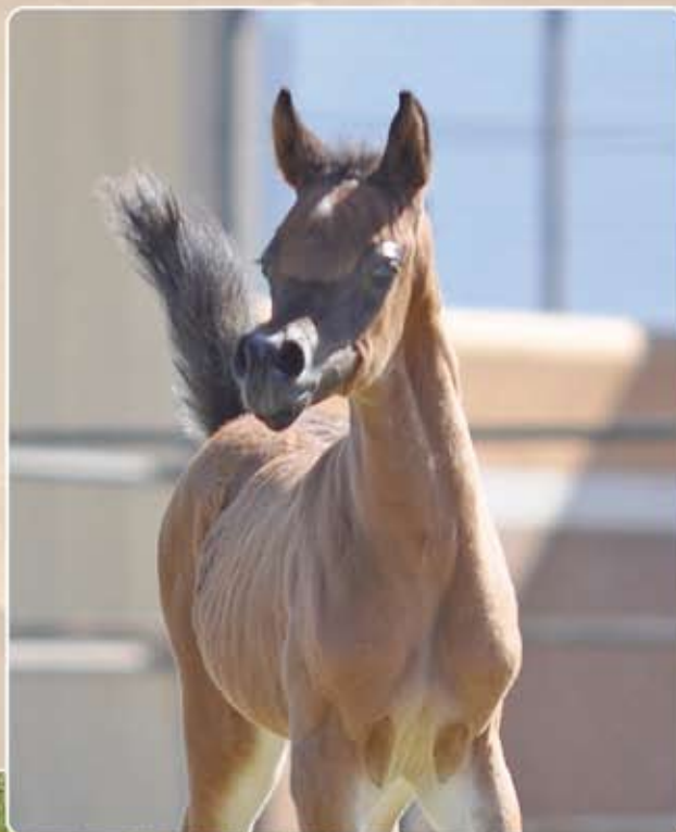
Homebred Filly 2012 ADRIANA BV (BV Pigmalion x Anjelina BV)