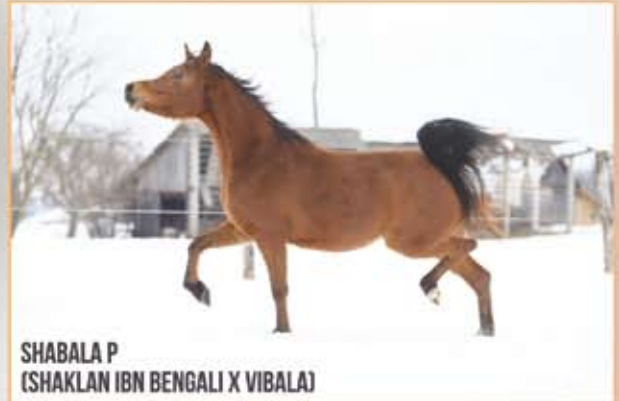
SHABALA P (SHAKLAN IBN BENGALI X VIBALA)