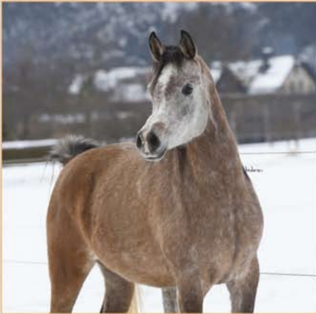
EL ZILAL MASRIYAH (SE) (CLASSIC MANSOUR X TARISSIA B)