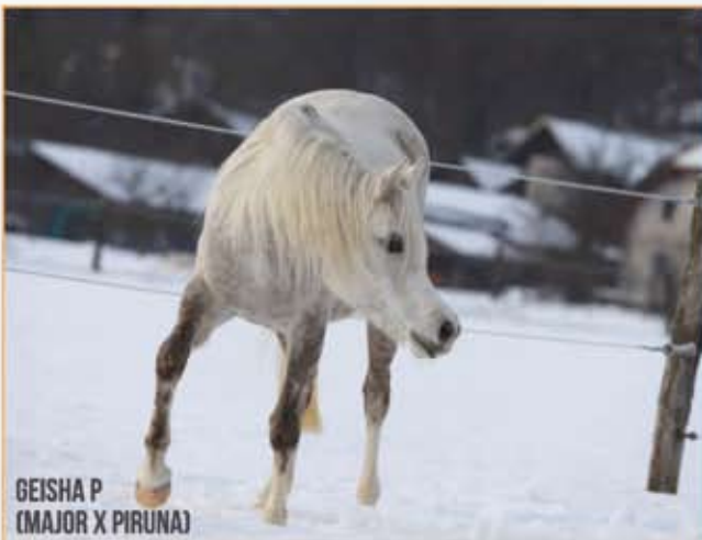
GEISHA P (MAJOR X PIRUNA)