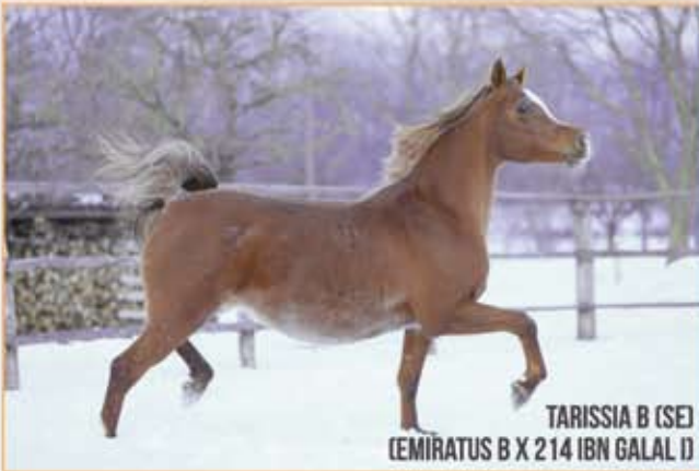
TARISSIA B (SE) (EMIRATUS B X 214 IBN GALAL I)