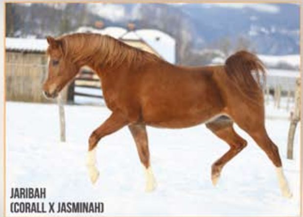
JARIBAH (CORALL X JASMINAH)