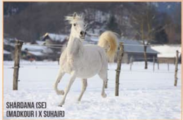
SHARDANA (SE) (MADKOUR I X SUHAIR)