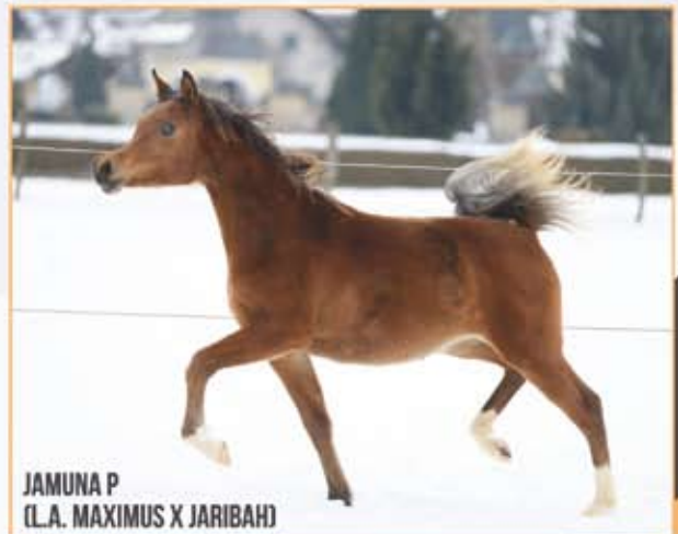
JAMUNA P (L.A. MAXIMUS X JARIBAH)