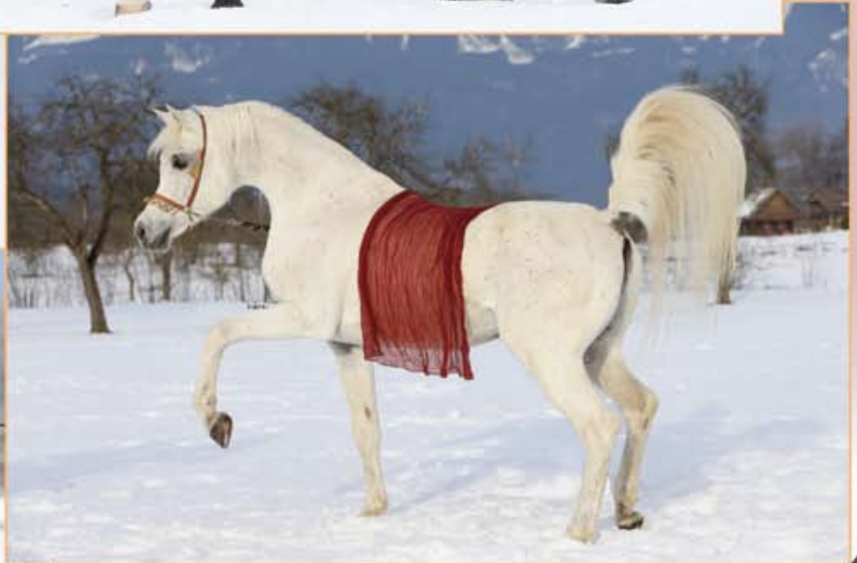
AS SINANS PACHA (ANSATA SINAN X SASKIA R.J.)