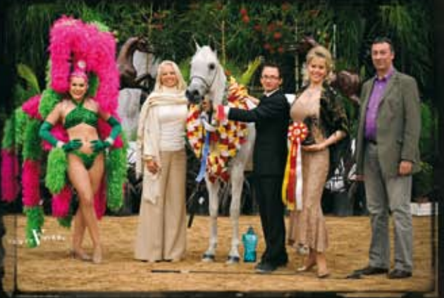
Embra - Res. Champion Mare Vegas 2009