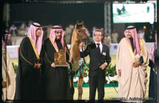
Siram Athbah Res. Champion Al Khalediah 2010 - owned by Athbah Stud