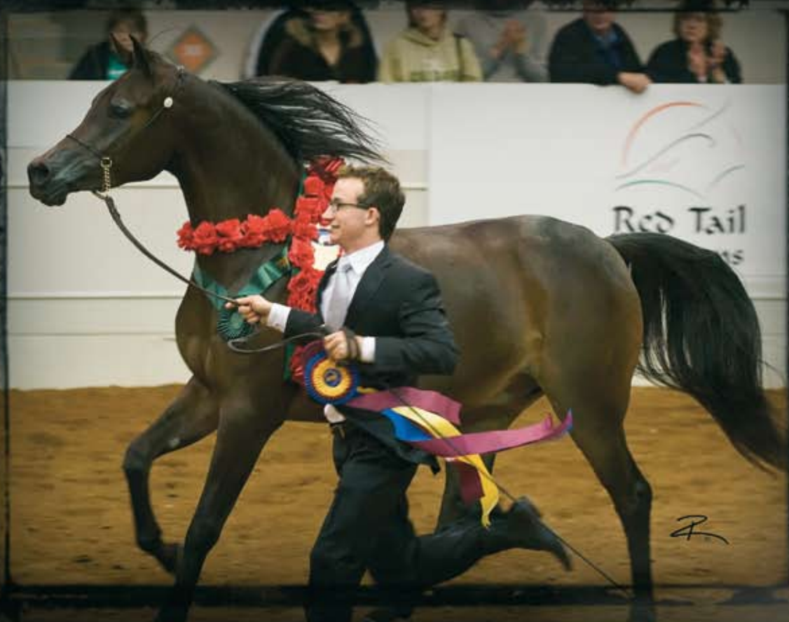
■ Ssantana by Gazal Al Shaqab winning the US National Championship