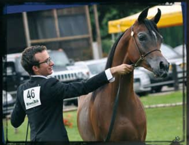
Emerald J - Champion Colt Ströhen 2011