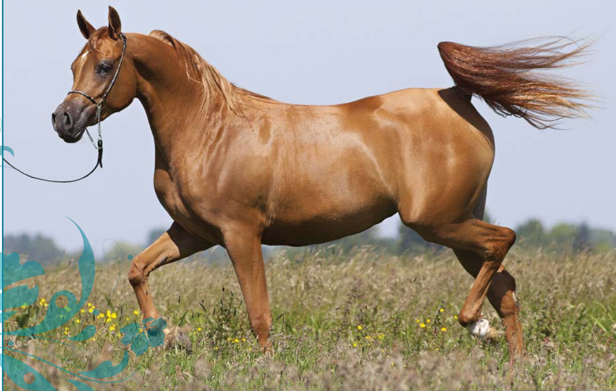
Vekaisa F (Kais x Veronia F By Abakan)