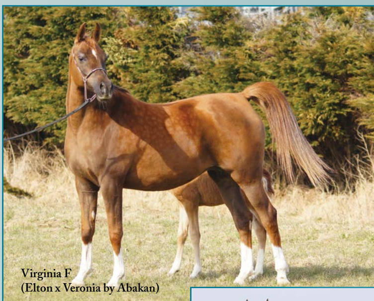
Virginia F (Elton x Veronia by Abakan)