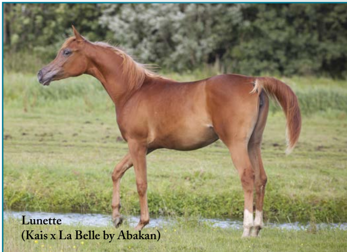
Lunette (Kais x La Belle by Abakan)