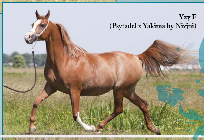
Yzy F (Psytadel x Yakima by Nizjni)