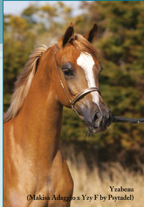
Yzabeau (Makisa Adaggio x Yzy F by Psytadel)

purchased from a Dutch breeder in 1993. Representing her mother was former Dutch National champion La Brunette (by Almonito), La Belle (by Abakan) and her daughter Forelocks Lunette (by Kais) who has been very successfully shown as a filly. All three seem to be very consistent in their type and movement! The latest representative of this L-line is the flashy colt Forelock's Lacoste, by Psytadel and out of La Belle, who looks to be a great addition to the Forelocks breeding program!