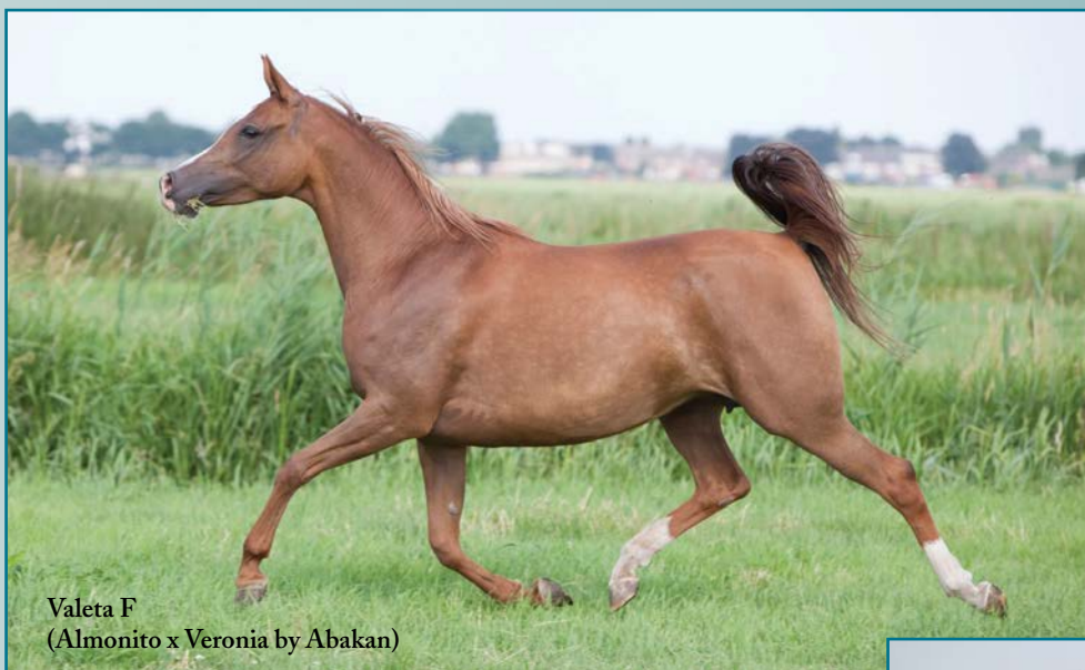
Valeta F (Almonito x Veronia by Abakan)