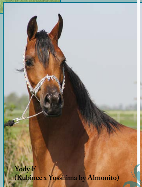
Yody F (Kubinec x Yosshima by Almonito)