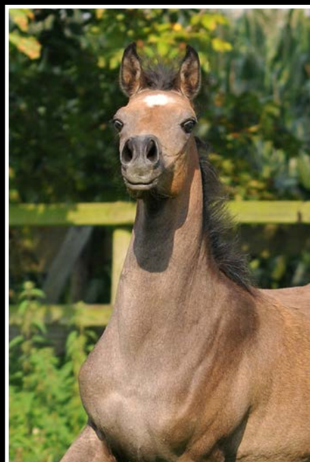
ASE Jazzaree (Jazzmeen x Dakaree) 2011 grey filly