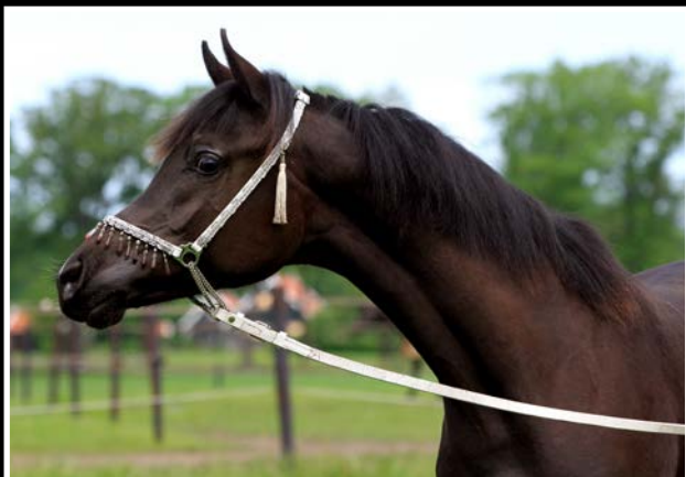
Imeleena J (Jazzmeen x Illyria el Jamaal) 2004 grey filly

ASE Parissia by Jazz - 2011 black filly (Jazzmeen x Parnassia) Bred and owned by Arabian Stud Europe