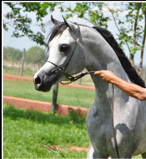
Iternity J (Aryes el Ludjin x Imeleena J) 2008 grey colt